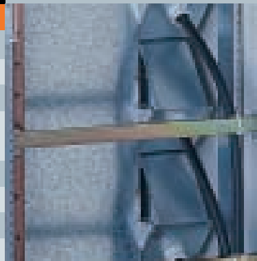
Cable connection compartment at the rear with one cable gland box per functional unit, internal separation Form 4 Type 7 according to BS EN 60439.